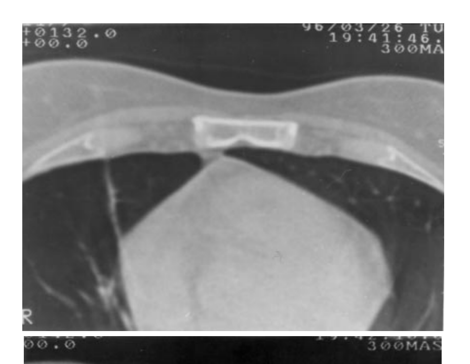
Figure 1. The cut above the foramen.