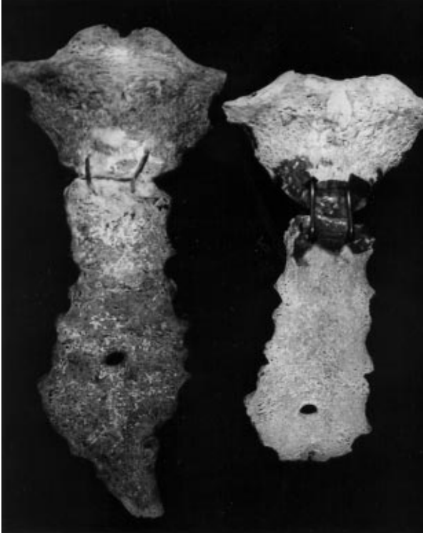
Figure 4. Two sternal bones with midline sternal foramina.