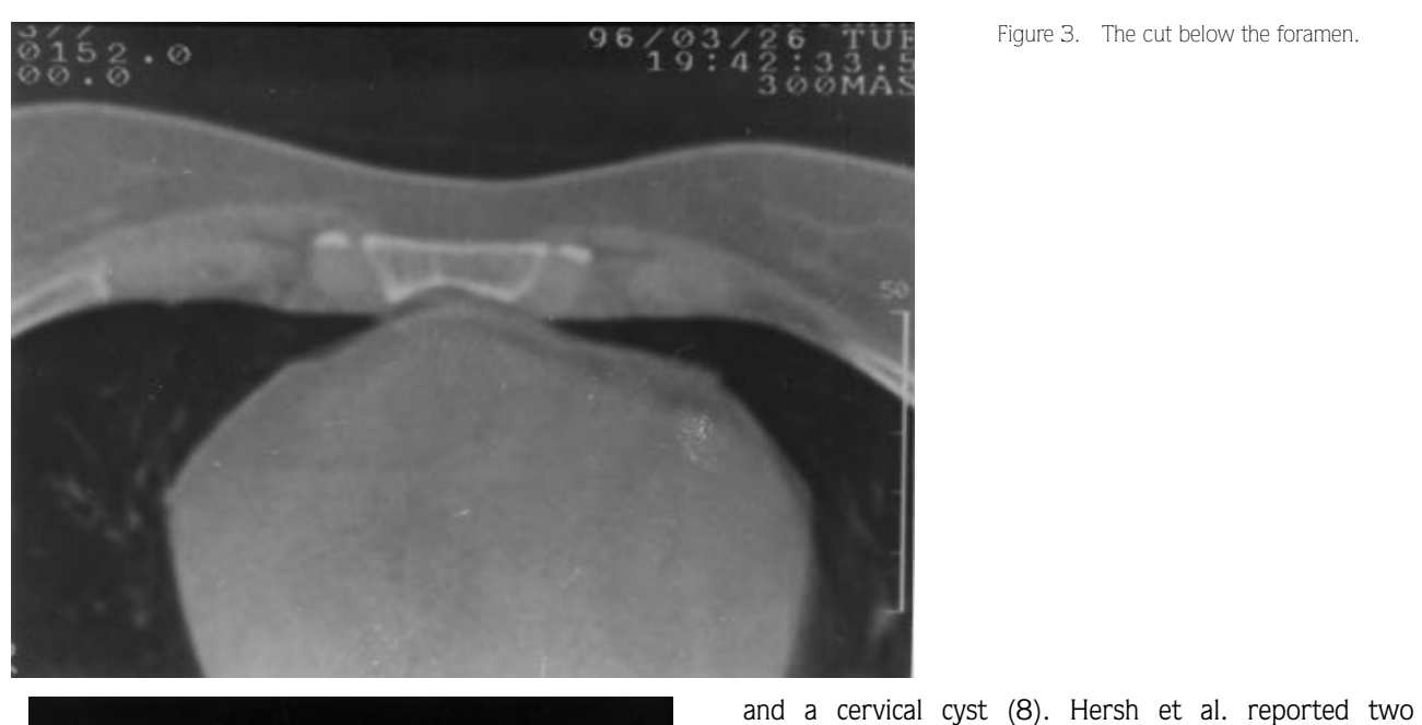
Figure 3. The cut below the foramen.