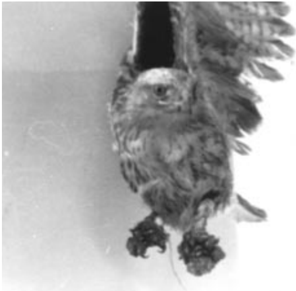
Figure 1. Avipox nodules on the toes, eyelid and beak.

The mortality from this disease is attributed to the bird's inability to capture prey because of the severity of its foot lesions and blood loss (7). At necropsy, the bird was observed to be in a very poor condition and there was no food in its gizzard. This was because of the inability to hunt, due to both the nodules on feet and the leg fracture.