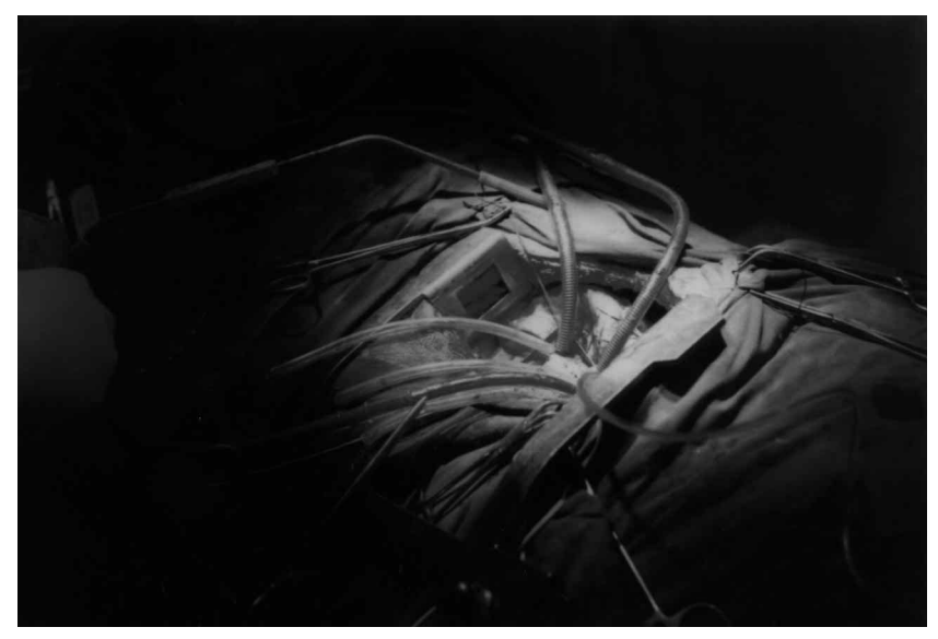
Figure 2. Cardiopulmonary Bypass Procedure and Cannulation.