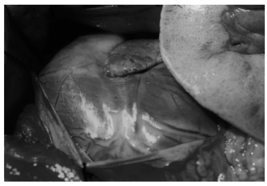
Figure 1. View of the Heart after Pericardiectomy.