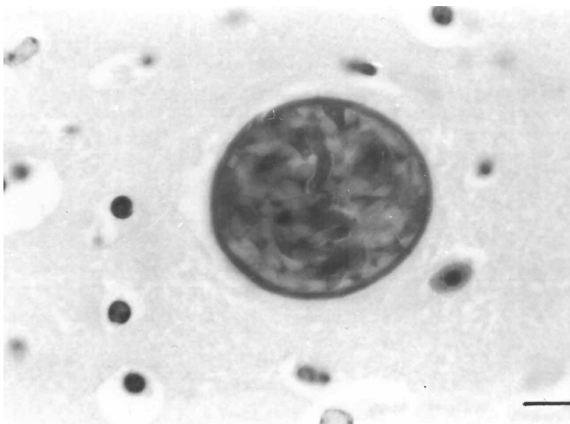
Figure 2. A mature sarcocyst in the cerebrum. Bar = 10 \mu m.

occurred after the flocks were moved from a clean environment such as the hill pastures to areas heavily contaminated by dog feces or when they were housed in such an infected environment (3-7). In addition, stresses such as pregnancy, lactation, poor nutrition, and weather may play an important role in the severity of clinical