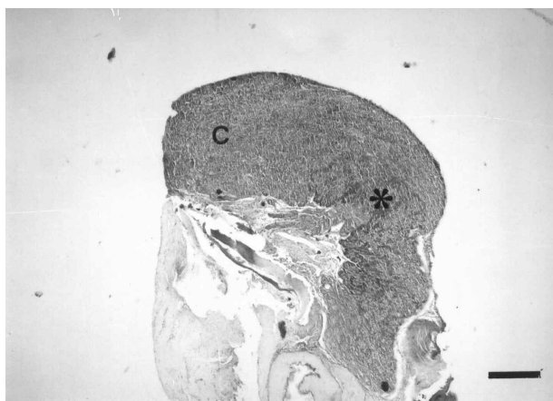
Figure 1. Cephalic and caudal zones of the pars distalis, cephalic (C), caudal zones (*), triple. Bar 350 µm.

FSH-ir cells were localized in both the cephalic and caudal zones of the pars distalis. However, they were distributed differently throughout the pars distalis of the 5 month-old laying hens (Figure 2). FSH positive labeling was observed in the cytoplasm of the gonadotrophic cells. FSH-ir cells stained brown with DAB chromogen had a small amount of cytoplasm, and spherical or ovoid and relatively euchromatic nuclei located at the center of the cells (Figure 3). The staining densities of the FSH-ir cells in the cephalic and caudal zones are shown in the Table. The average numbers of FSH-ir cells were similar in the cephalic and caudal zones. Additionally, the strongest positive reaction for FSH-ir cells was observed in both zones (Table). While limited number of weakly stained (+) FSH-ir cells were observed, moderately stained (++) FSH-ir cells had the same arithmetical average rate in both zones. FSH-ir cells of the pars distalis appeared to be arranged in either cords or follicles in which branching and anastomosing occurred, as well as being found as separate cells (Figure 4). Those cords and follicles had thin diameters and thus most cells were touching or close to the external surface of the cords. They were elongated in different shapes and were polarized towards the sinusoids of the pituitary gland.