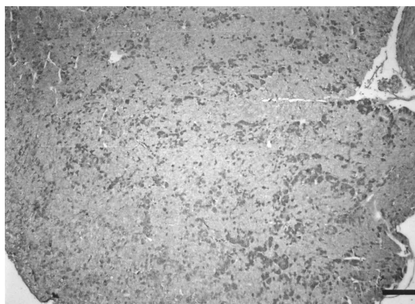
Figure 2. FSH-ir cells. Bar 140 µm.