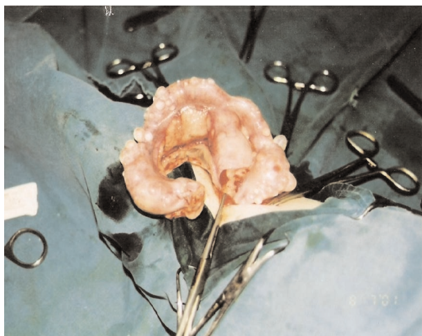
Figure 1. Uterine and ovarian metastasis.

enlargements of the uterine wall were determined by ultrasound. Ovariohysterectomy was performed because of uterine and ovarian pathology. It was corrected by histopathologic examination of a hematoxylin and eosin-stained sample revealing uniform round cells containing eosinophilic cytoplasm and large nuclei with prominent, central located nucleoli. The masses in the uterus and ovaries originated from the vaginal tissue (Figures 1 and 2). After diagnosis, 0.025 mg/kg vincristine sulfate was administrated every 7 days for 4 weeks. The amount of hemorrhagic vulvar discharge decreased in the 4 days after the first administration and the clinical and vaginal cytology examinations confirmed that the bitch was cured totally after therapy.