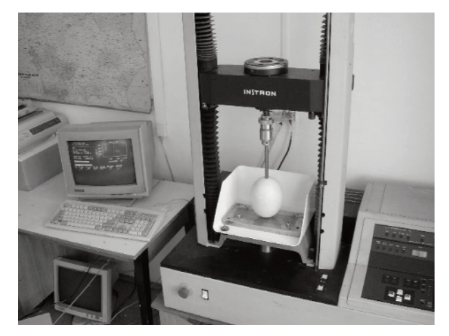
Figure 1. Use of an Instron to determine vertical shear force required to fracture the ostrich eggshell.

The paleontological evidence indicates that birds inherited the shape and the structure of the eggshell from their egg-laying predecessors (3). Likewise, the basics of the exogenic egg features, for example, nesting behaviour (4), could have been acquired from the non-avian ancestors. Birds evolved over 150-200 million years ago (mya) during the Mesozoic era from the Pterosaurs, or flying dinosaurs. This period may have been variable, as 2 new species of feathered dinosaurs were discovered in China dating 125-145 mya. An Archaeopteryx fossil found in 1861 in Germany revealed the first clue of the ancestral link between reptiles and birds. Archaeopteryx