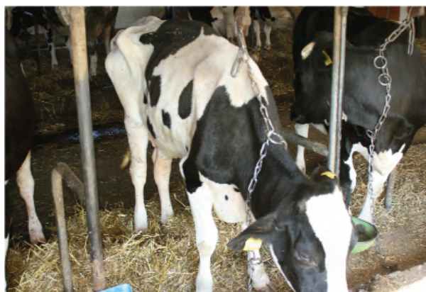
Figure 1. The study heifer.

The serological assay was conducted with the IDEXX ELISA test ( Mycobacterium paratuberculosis antibody ELISA test kit), according to the manufacturer's instructions. Absorbance of the sample was measured with a DANEX MRX microplate reader at a wavelength of 450 nm. The presence of antibodies was calculated based on the ratio of absorbance of the experimental sample to