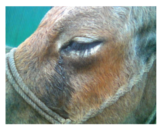
Figure 1. Blepharospasm and epiphora.

Sarabhai), the animal was cast in right lateral recumbency. Peterson nerve block (including the auriculopalpebral nerve) was given using 13 mL of 2% lidocaine hydrochloride (gesicain, Astra Lab). Dry plant material was observed to have penetrated vertically 1 cm from the center in the lower half of the corneal surface of the left eye (Figure 2). The exposed length of the foreign body was 0.5 cm. Using a hemostat close to the corneal surface, the plant material was carefully removed without breaking (Figure 3). After taking a swab from the depression