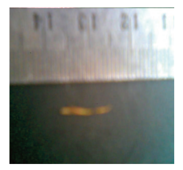
Figure 4. Foreign body 1.2 cm in length and 0.5 cm in diameter.

direct ophthalmoscopic examination did not reveal any appreciable change in the ocular media. Resolution of the symptoms and regaining of sight were reported by the owner after 2 weeks. Clinical examination 3 weeks postoperatively confirmed these findings; however, a 0.25-cm circular scar was still visible at the site of the foreign body penetration.