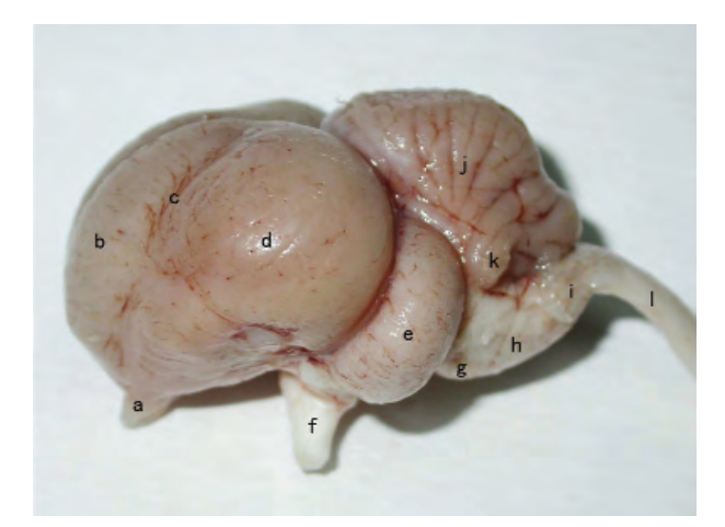
Figure 3. The lateral view of the African ostrich brain. a, olfactory bulb; b, sagittal prominence; c, telencephalic vallecula; d, cerebral hemisphere; e, optic lobe; f, optic chiasm; g, midbrain; h, pons; i, medulla oblongata; j, cerebellum; k, cerebellum auricle; l, spinal cord.

1) Cerebrum: The cerebrum of the ostrich appears as an obtuse triangle from the dorsal view, but that of the Oriental white stork is a trapezoid, and the Pekin duck's and grey goose's cerebra appear as tapers. The middle of the head of the ostrich's cerebral hemisphere is a relative cusp, linking to the undeveloped olfactory bulb. The posterior part of the cerebral hemisphere is