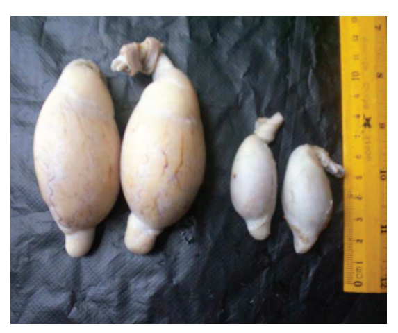
Figure 2. Smaller testes of a buck with bilateral testicular hypoplasia (right) and full-sized testes (left) from a buck of comparable age.

adult plain white (Borno white) Sahel goats was 24.7 \pm 5.3 kg. Kwari et al. (4) reported ages and weights of Sahel bucks at slaughter as 1.0-1.5 year and 11.5-24.5 kg, respectively. Mature adult weights of Sahel bucks were variously reported as 30-40 kg (3), 26.8-28.2 kg (16), and 25-37 kg (17).