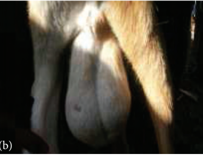
Figure 1. Posterior view of 2-year-old Sahel bucks with small-sized hypoplastic (a) and full-sized normal (b) testes in their scrotal sacs.