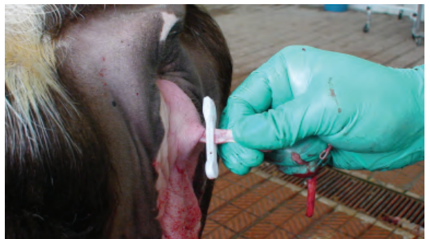
Figure 3. The clamped umbilical artery.