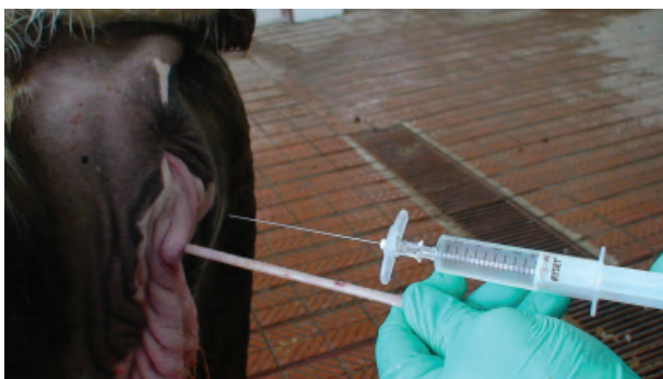
Figure 1. The spinal needle and umbilical artery used in this study.

All of the cows had dystocia and single-calf parturition. The cows were randomly divided into 3 equal subgroups. The first, second, and third groups (each group containing 20 cows) were administered 100 IU oxytocin, 0.15 mg d-cloprostenol, and 10 mL 0.9% NaCl, respectively, via intraumbilical artery immediately after expulsion of the fetus. All injections were applied to the umbilical cords, whose arteries and veins were massaged for 5 min for blood remnant removal. The injection to the umbilical cord artery was carried out as near as possible to the uterus using a spinal needle (22 G, 0.70 × 89 mm, Exelint International Co., Los Angeles, CA, USA). Additionally, in order to better introduce the injected substances (oxytocin, cloprostenol, or NaCl) to the uterus, the upward umbilical artery was massaged upwardly after each application and then the umbilical artery was clamped (Figures 1-4). All of the cows were observed at intervals of 10 min/h after parturition to determine the time of fetal membrane