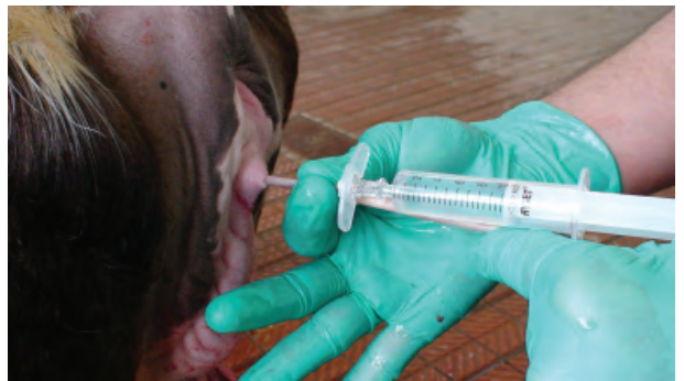
Figure 2. Injection of the tested drugs into the umbilical artery.

All biochemical parameters and fetal membrane removal times were evaluated with Kruskal-Wallis variance analyses and the independent Student's t-test. Fetal membrane removal and nonremoval rates were evaluated by the chi-square test (26,27).