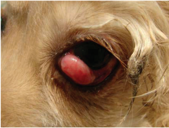
Figure 1. Unilateral prolapse of the third eyelid gland in an American Cocker spaniel dog.