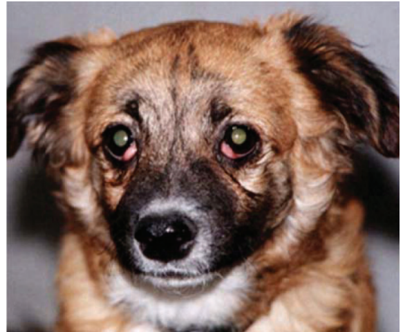
Figure 2. Bilateral prolapse of the third eyelid gland in a mixed-breed dog.

(5 cases), spitz (2 cases), Pointer (1 case), American Cocker spaniel (1 case), English bulldog (1 case), French bulldog (1 case), and mixed-breed (5 cases) (Table 1). Seventeen of the dogs were male and 11 were female. The ages of the dogs at the time of the diagnosis ranged from 2.5 months to 4 years, with a median of 11.08 months (Table 2).