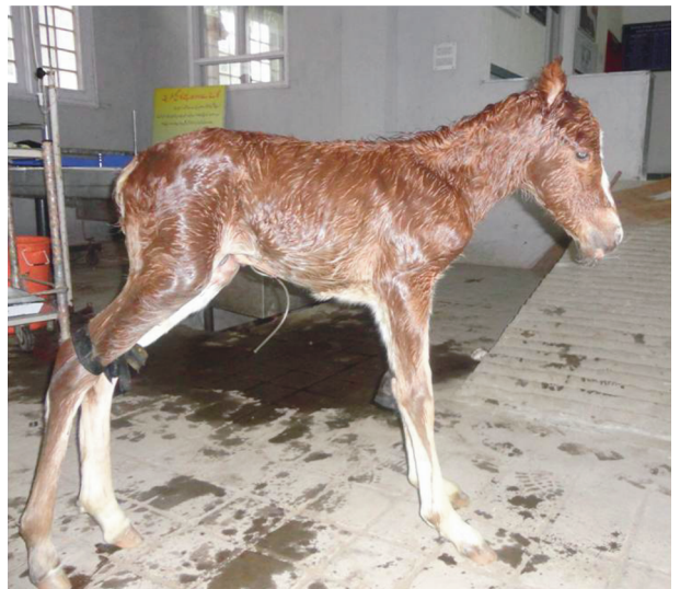
Figure 2. Foal after tube cystotomy with a catheter fixed to the skin by 2 stay sutures.

between septicemia, urinary tract infections, and rupture of the urinary tract/urachus. Colts are more at risk because of their long, narrow, high-resistance urethra, which is less likely to allow bladder emptying, resulting in cystorrhesis during parturition when high pressures are applied focally or circumferentially around the bladder (9). However, the condition does also occur in females (10).