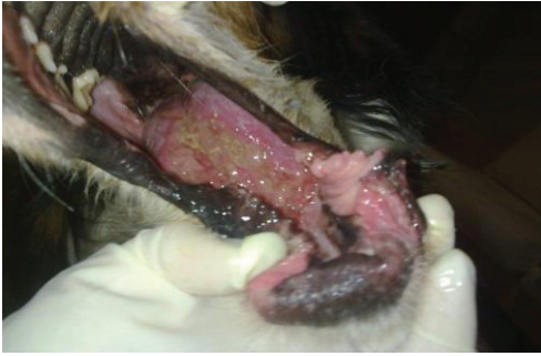
Figure 3. Appearance of the patient 10 days after treatment.

later, despite a tissue loss of approximately 1.5 cm at the tongue apex, the function of the tongue itself was seen to be entirely normal (Figures 4a and 4b).