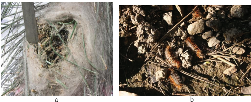
Figures 2a and 2b. Tongue edema and necrosis in a 3-year-old English Setter due to contact with pine processionary caterpillars.

Routine follow-ups of the patient were continued at weekly intervals. In the examination carried out 28 days