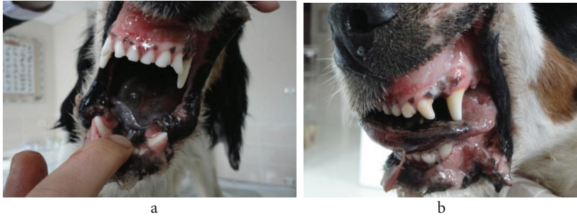
Figure 1. Protective silk case of the pine processionary caterpillar (a) and appearance of the caterpillars in the L5 stage (b).

with its treatment, was evaluated and the results obtained are presented.