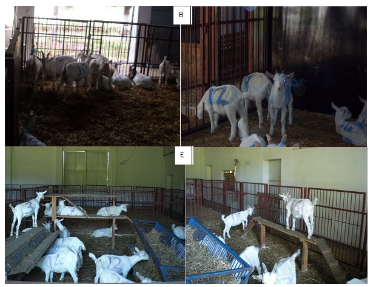
Figure 1. Barren (B) and enriched (E) environments of experiment.

Forty Turkish Saanen goat kids born in the same week were used in the study. Following birth, the kids stayed continuously with their mothers until the age of 7 days and were then divided into the two experimental groups on the 8th day. Each group included 10 females and 10 males with 6 single and 14 twins kids. The average initial