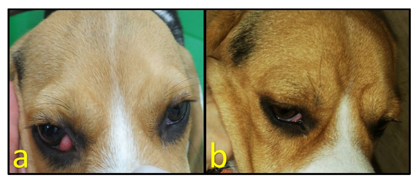
Figure 2. In a Beagle (case 21) with acute unilateral NGP: a) before surgery, b) postoperative (2nd month).

the gland tissue remains open to various pathologies, and inflammation and irritation persist. Removal of the gland may cause tear secretion to be reduced by up to 40% and secondary keratoconjunctivitis sicca (dry eye disease) formation. Therefore, partial or complete removal of the gland should not be preferred [2,15,22,26]. Most of the breeds identified to be predisposed to NGP have also been reported to be predisposed to dry eye disease, but there is no defined relationship between these 2 diseases [27]. Due to the simplicity of the technique, some researchers have tried the treatment by removing the gland [17,28]. However, surgical repositioning techniques are more