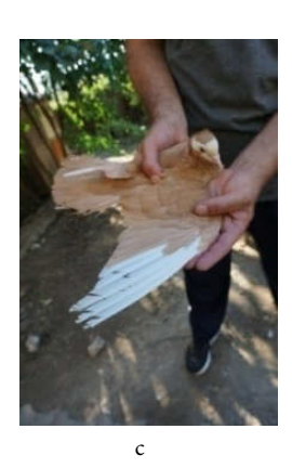
Figure 5. Basic plumage colors of Alabadem pigeons. a) Black, b) Red, c) Yellow.