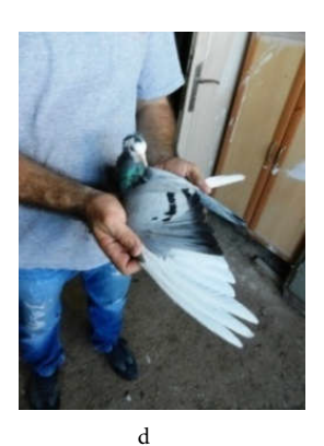
Figure 6. Intermediate plumage colors of Alabadem pigeons. a) Citrin, b) Ashy, c) Chickpea, d) Scarlet.