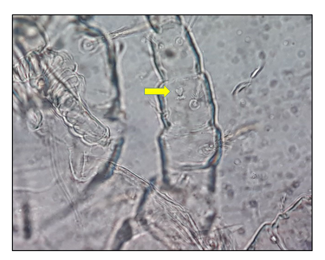
Figure 4. Cheyletiella yasguri, heart-shaped sensory organ on genu I (original).

[17]. Apart from the study conducted by Tüzer [17], the literature review indicates that no C. yasguri infestation was reported in dogs or any other mammals in Turkey. This study reports C. yasguri infestations in six puppies for the first time in Kocaeli province of Turkey. It is thought that Cheyletiella infestations in dogs may be caused by an asymptomatic carrier dog coming from outside or living in the same household. It should be kept in mind that phoretic transmission by insects may play a role in the spread of infestation [24].