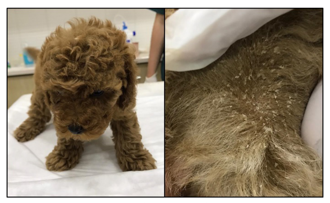
Figure 1. A Poodle puppy infested with Cheyletiella yasguri and dandruff on its dorsum (original).

The puppies and three other adult dogs were treated with spot-on formulation of selamectin (Stronghold 6%, Zoetis, Parsippany, NJ, USA). The solutions in 0.25 mL tubes containing 15 mg of active ingredient were applied on the skin surface between the shoulders of dogs on the initial part of the neck. The owner of the animals was advised that dogs should be combed in the days after treatment. Besides, all dogs were isolated from their