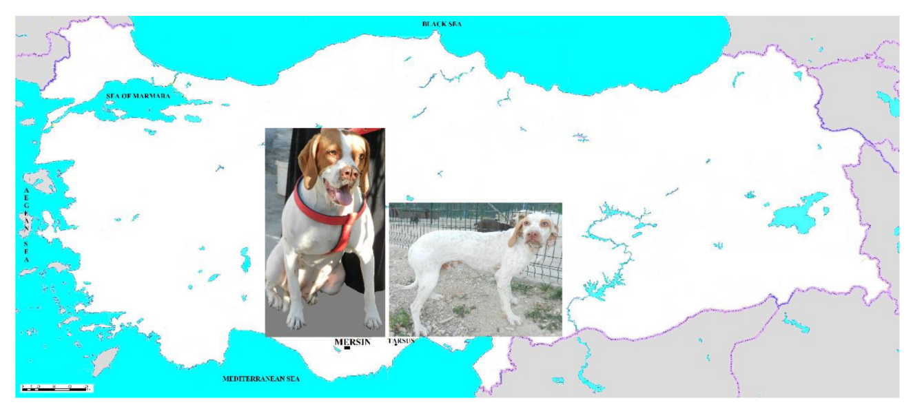
Figure 1. Çatalburun dogs and the territories where the samples are collected1.

18-135). The morphological traits were measured in a total of one-hundred pedigreed, 12 month of age or elder Catalburun dogs, which were raised in Mersin province (latitude, 36.812103 N; longitude, 34.641479 E) and adjacent area (Tarsus). A total of sixty-two blood samples were intentionally taken from outbred dogs by considering their pedigrees. In this manner, the blood samples of each individual are thought to be the best representatives of their breed characteristics. It was observed that all of the trial animals were individually kept in kennels or in boxes. Females in heat are held together with proper males for three days to ensure pedigreed breeding. Although the daily diets vary within the bounds of owners' possibilities, adult ones are allowed to consume home-made and meatbased meals once a day. Live weights and morphological head and body measurements have been taken by proper methods, which were previously reported by various researchers [6-8]. SPSS software (v17; SPSSInc., Chicago, IL, USA) has been used to perform statistical analyses of the data. A p-value less than 0.05 was considered statistically significant. As an inferential statistic, t-test was applied to compare sex groups for any examined trait. The one-way analysis of variance was performed to test significance of the differences between age groups, and then Duncan's multiple range test was applied for multiple comparison of age groups [9].