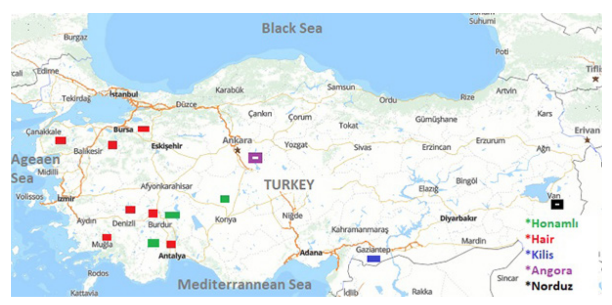
Figure 1. Locations of samples collected during the experiment in Turkey (Hair, Honamlı, Kilis, Angora and Norduz goat). The map should be downloaded from the Republic of Turkey, General Directorate of Mapping and the related reference should be given here as a footnote.

PrimersequencesofKAP1.1F:5'-CAACCCTCCTCTCAACCCAACTCC-3',R:5'-CGCTGCTACCCACCTGGCCATA-3'[10],KAP1.3F:5'-CAAGCAGACCAAACTCAGAAAC-3',R:5'-TGTCCACAGTAGGATGGGCGGC-3'[16]andK33